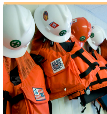
Worker Safety: Protective equipment.

The following studies are ongoing and planned for completion in late 2014 and 2015: