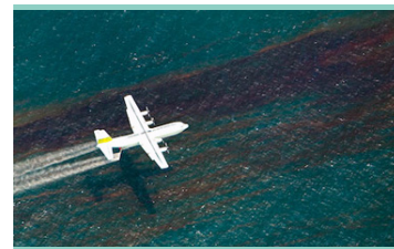
A plane releasing dispersants on a surface oil slick.

As part of the JITF effort, a project team was formed to evaluate best practices developed during the Deepwater Horizon (DWH) response for safely and successfully applying dispersants to surface oil slicks. The project team developed a guidance document to assist companies in pre-planning for large scale aerial and/or vessel dispersant application programs, as well as the preparation of a dispersant operations guide at the time of an incident. The final draft document was completed in the Spring of 2014 and shared with several agency response experts for review and comment. Following feedback from these experts, the document was finalized in November 2014.